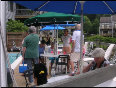
The early arrivals